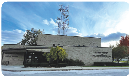
WBGU-PBS : A SERVICE OF BOWLING GREEN STATE UNIVERSITY